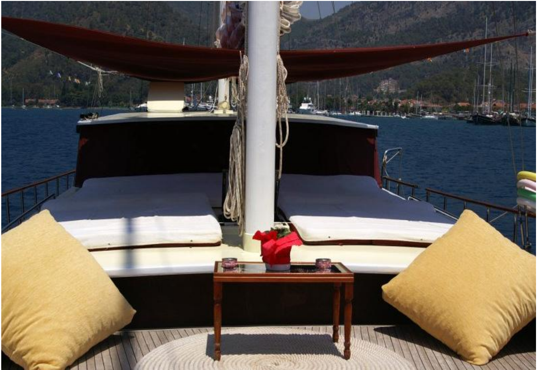
Spacious sun tanning area to enjoy the sunshine as you sail