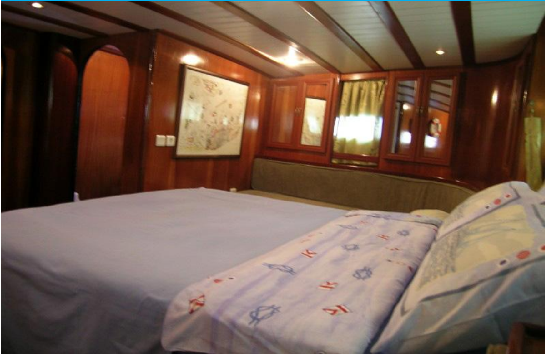
2 spacious master cabins