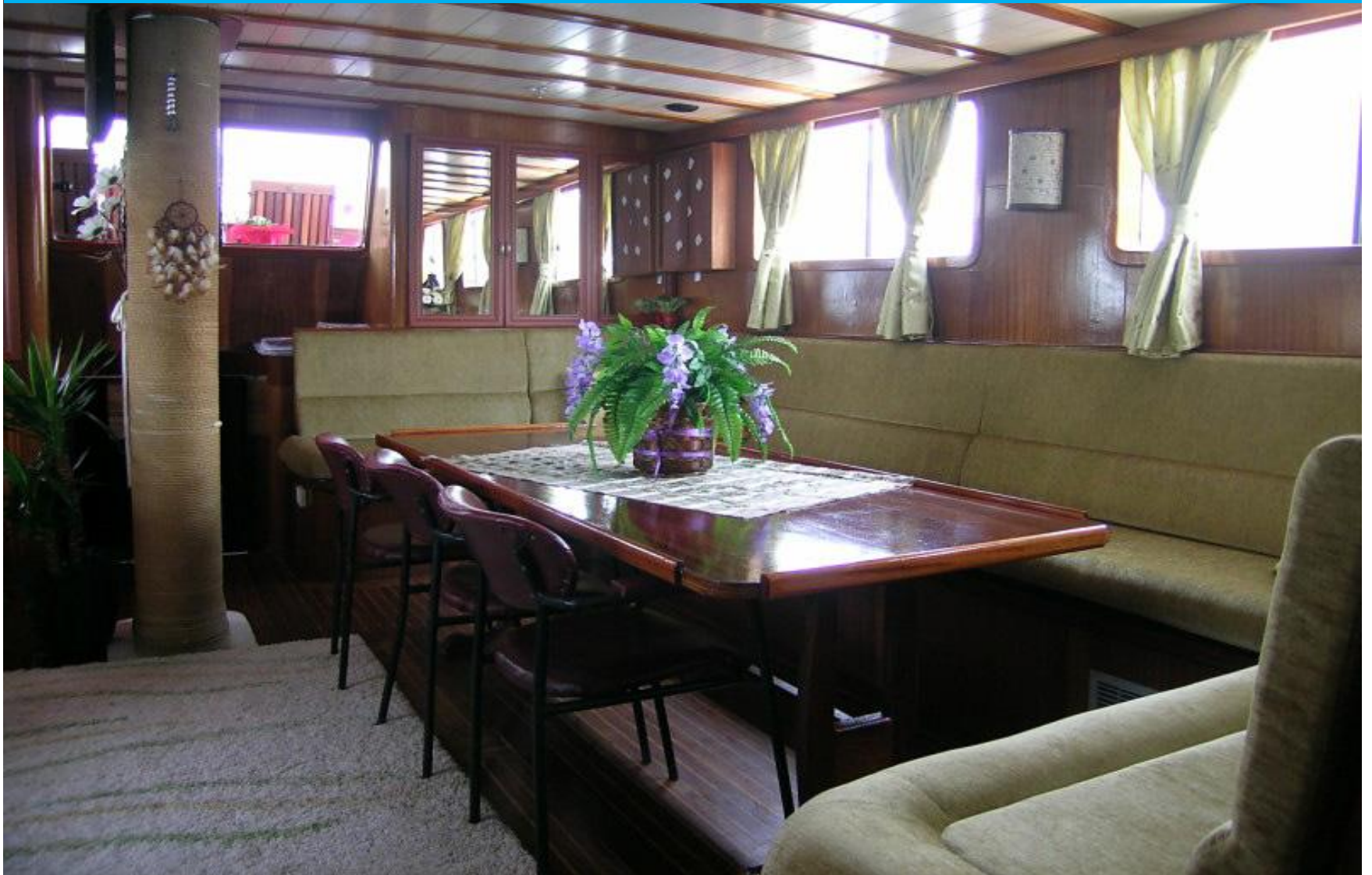
Spacious salon with interior dining area.