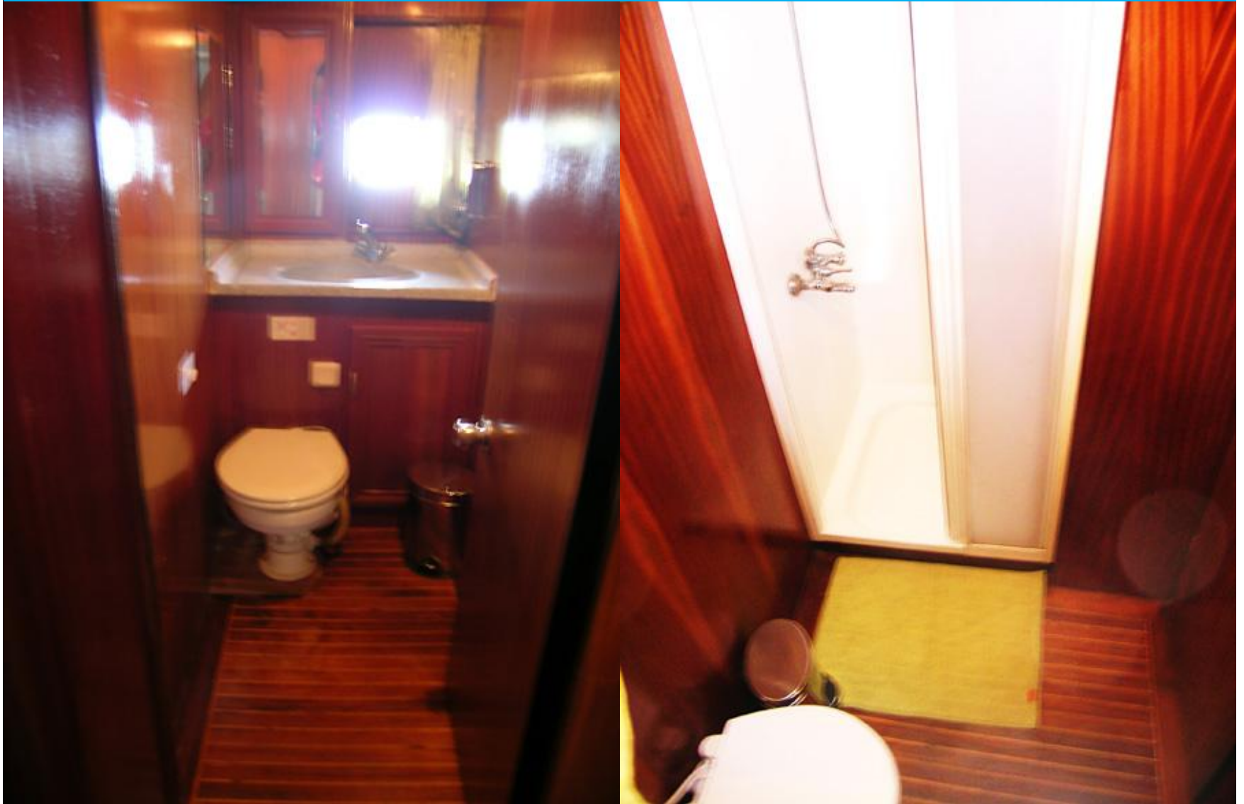
Home type toilet and ensuite shower cubicle