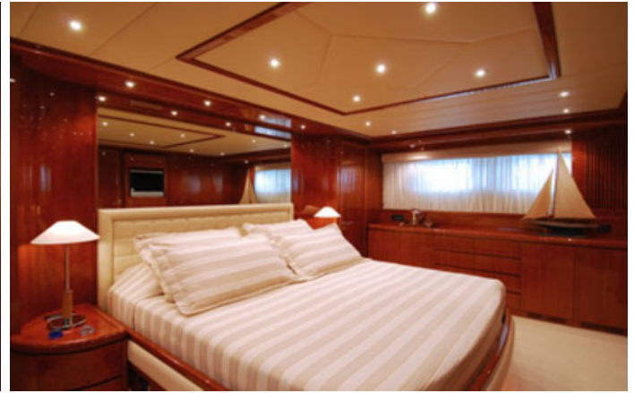
Guest cabin a