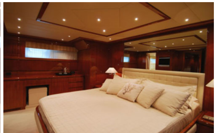
Master cabin a