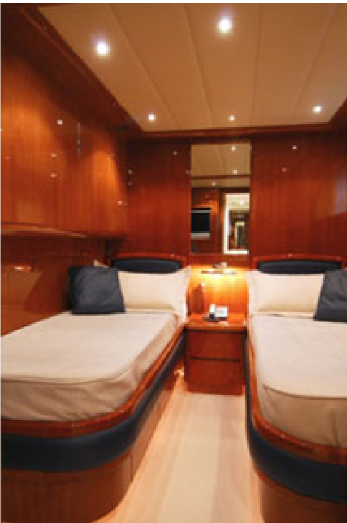
Twin guest cabin