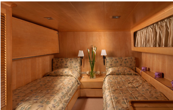
Twin Cabin a