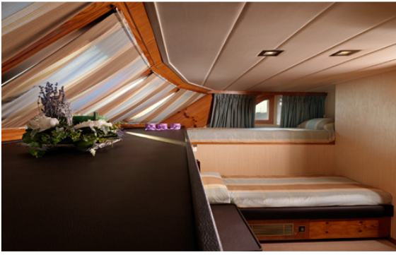
Triple Cabin a