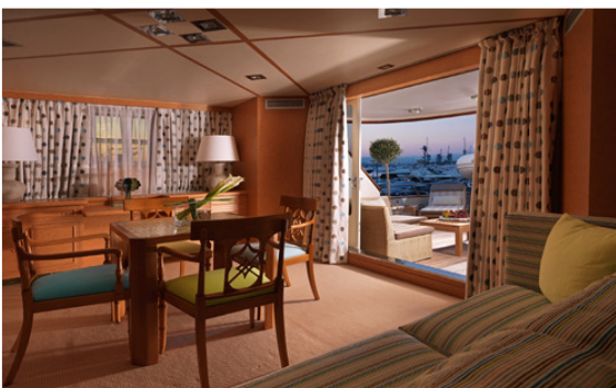
Upper Saloon a