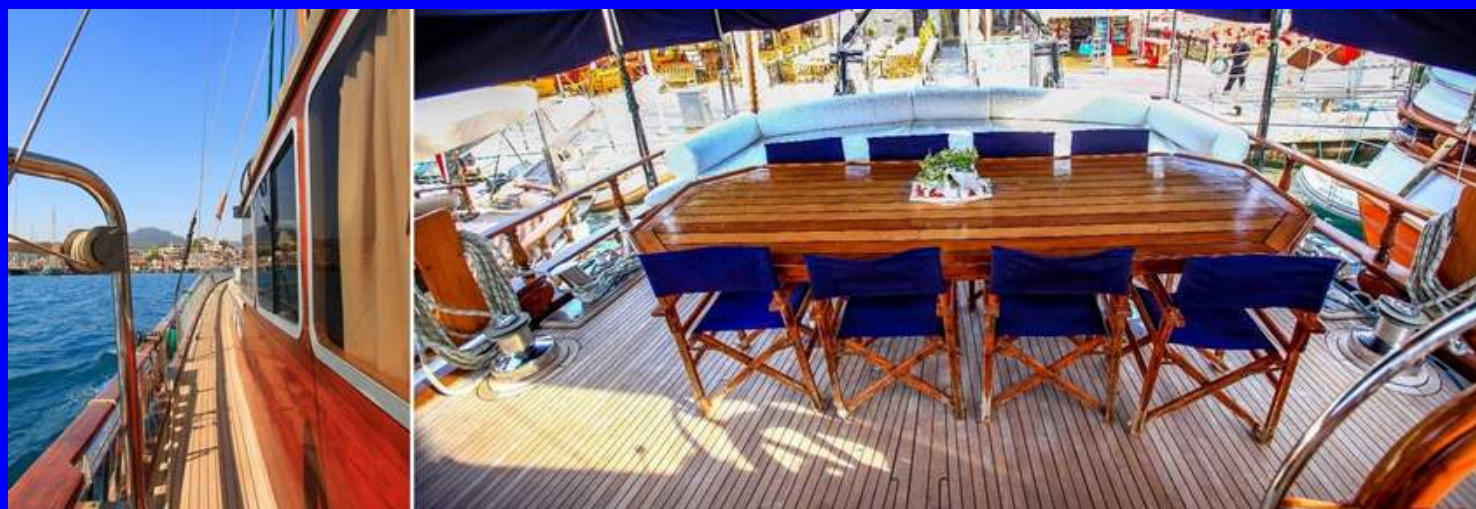
...and also a spacious living room :