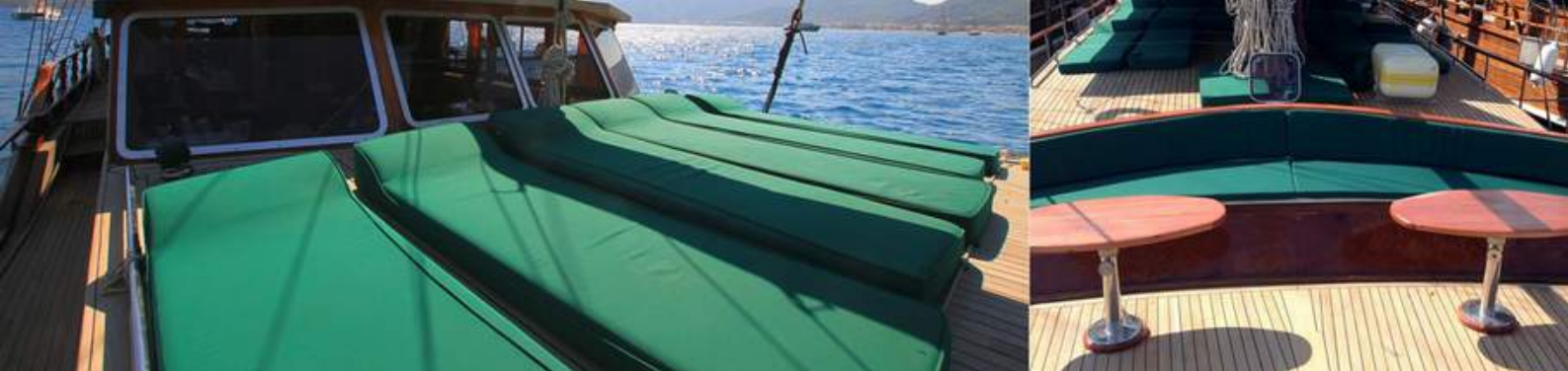
Large spaces outside...