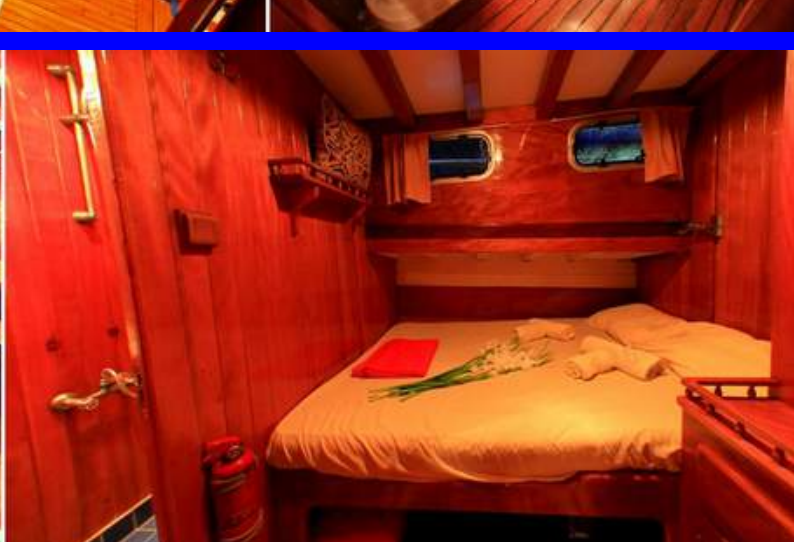
All other SUP cabins have a 160 cm wide bed and a shower box, except the A cabin.